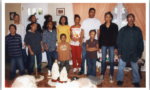
The Bell Choir from Cornerstone Baptist Church in Camden, ministered to our Senior Fellowship group at Christmas time. They did a God honoring job praising the name of Jesus, our Savior and Lord!